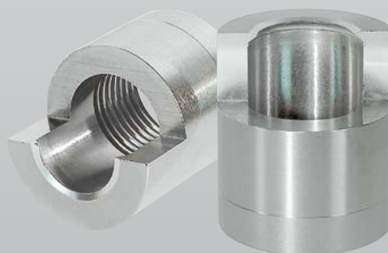
Weld-in sleeve LZE

(When using LZE-hygienic installation system)