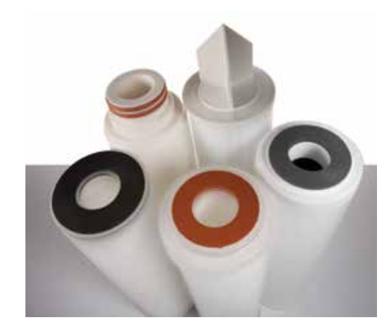
LOFPLEAT EE filter cartridges are available with a variety of gasket, configurations.