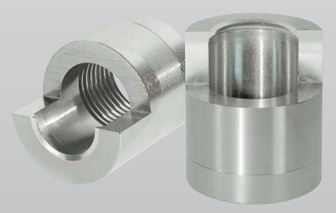
Weld-in sleeve LZE