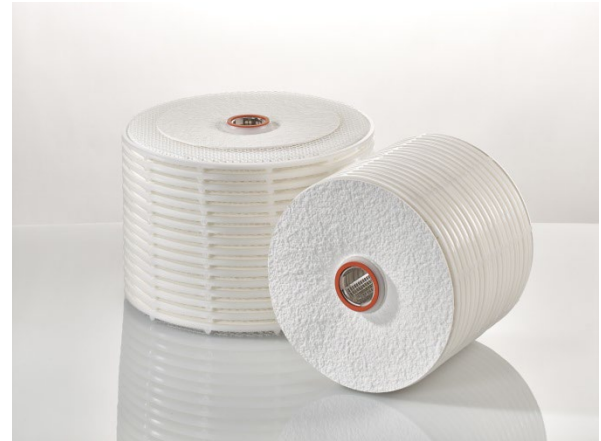
Water throughput BECODISC R+ range

BECODISC R+ stacked disc cartridges can be used for filtration of all liquid media. Application options range from coarse filtration to microbial removal filtration.