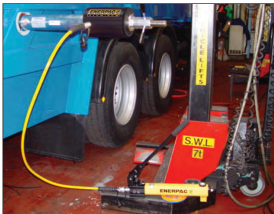
◀ An RACH-306, powered by a P-392 hand pump, is used to extract corroded carriage pins from refuse collection vehicles.