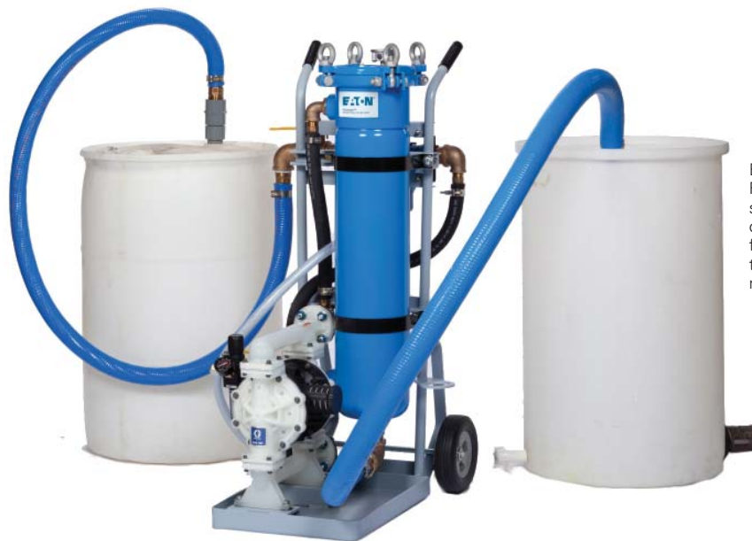
Eaton's FloWash Industrial Filter Cart is a flexible system that operates in-line or as a stand-alone portable filtration system. It is safe to operate and easy to maintain.