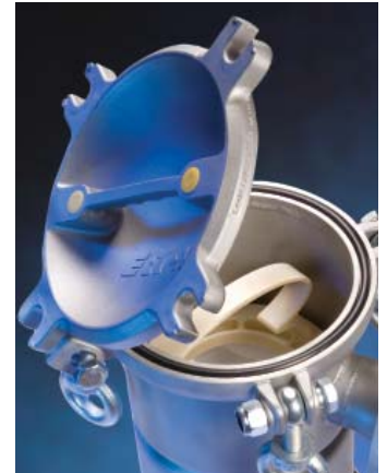
FLOWLINE II vessel incorporates an ergonomic integral cover handle for tool-free access. Unique internal body to basket seal prevents fluid bypass.