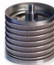
The disc cleaned Model DCF, MCF and MCS require the use of a slotted wedgewire design. Ratings of 15 to 1,600 microns are available.

Ratings from 2 to 1,650 microns are available.