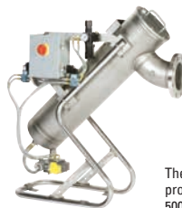
The MCS-500 can process up to 500 gpm

The MCS-1500 is a high-volume system with a flow rate of up to 1500 GPM.