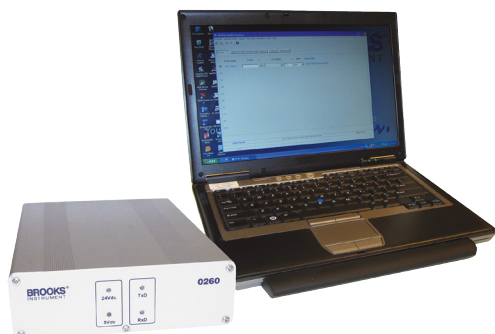
Model 0260 Secondary Electronics with PC