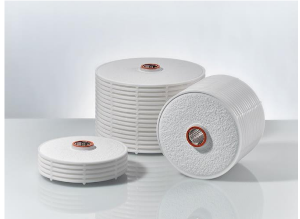
Water throughput BECODISC BS range

BECODISC B05S, B06S, B08S, B10S, B15S, B20S BECODISC stacked disc cartridges for achieving a high degree of clarification. These stacked disc cartridges reliably retain ultra-fine particles and have a germ-reducing effect making them particularly suitable for haze-free filtering of liquids prior to storing and bottling.