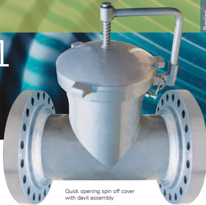
Quick opening spin off cover with davit assembly