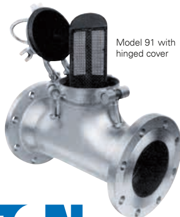
Model 91 with hinged cover

* Stainless steel strainers include carbon steel, external, non-wetted fasteners as standard.