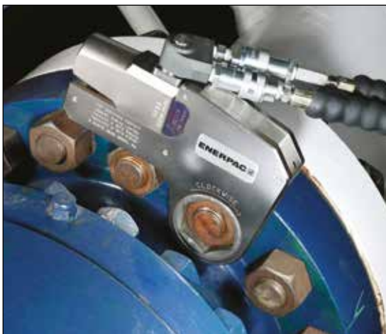
◀ The ZE4T-Series torque wrench pumps are perfectly matched for this W2000X wrench.