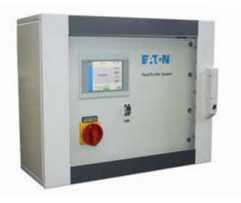
Web-enabled control unit with touch panel and USB interface