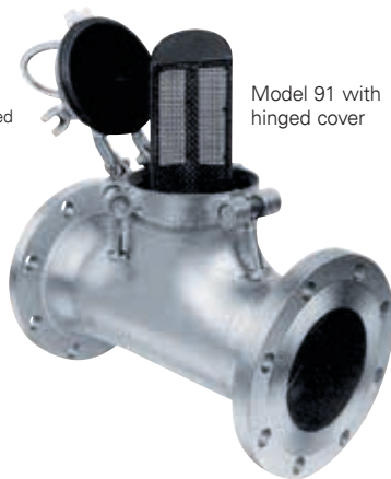
Model 91 with hinged cover

* Stainless steel strainers include carbon steel, external, non-wetted fasteners as standard.