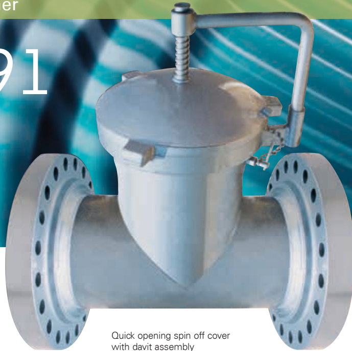
Quick opening spin off cover with davit assembly