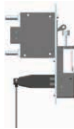
RBR rests Signal pulse sent to RBR for reset instruction: RBR actuates the Circuit Breakers handle