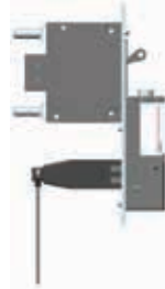
Circuit Breaker closed (protected circuit is powered)