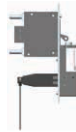
it Breaker opens (current is cut in the protected circuit)