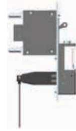
RBR Back to initial configuration (by gravity)

Eaton EMEA Headquarters Route de la Longeraie 7 1110 Morges, Switzerland Eaton.eu