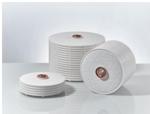
Water throughput BECODISC BT range

Polishing filtration of concentrated sugar solutions of approx. 65 °Brix and filtration of edible oils, vegetable extracts, liquid gelatin, and ointment bases consisting of primary products, oils, varnishes, polymer dispersions and separation of bleaching earth. Possible applications also include removing of activated carbon. Depending upon particle distribution of the activated carbon a single step filtration is possible.