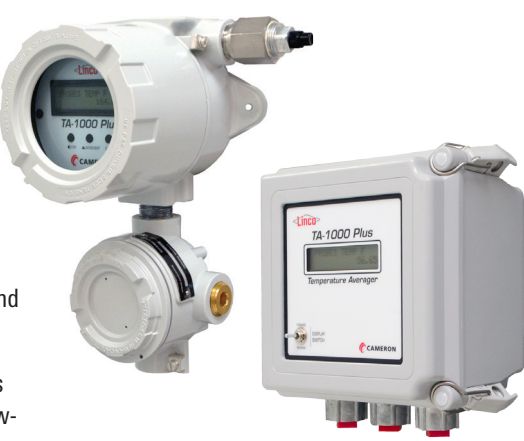
LINCO TA-1000 Plus temperature averager.

LINCO* TA-1000 Plus temperature averager is capable of acquiring more data, including flow-weight-average pressure, BS&W, and live net standard volume.