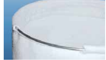
SNAP-RING seal ring